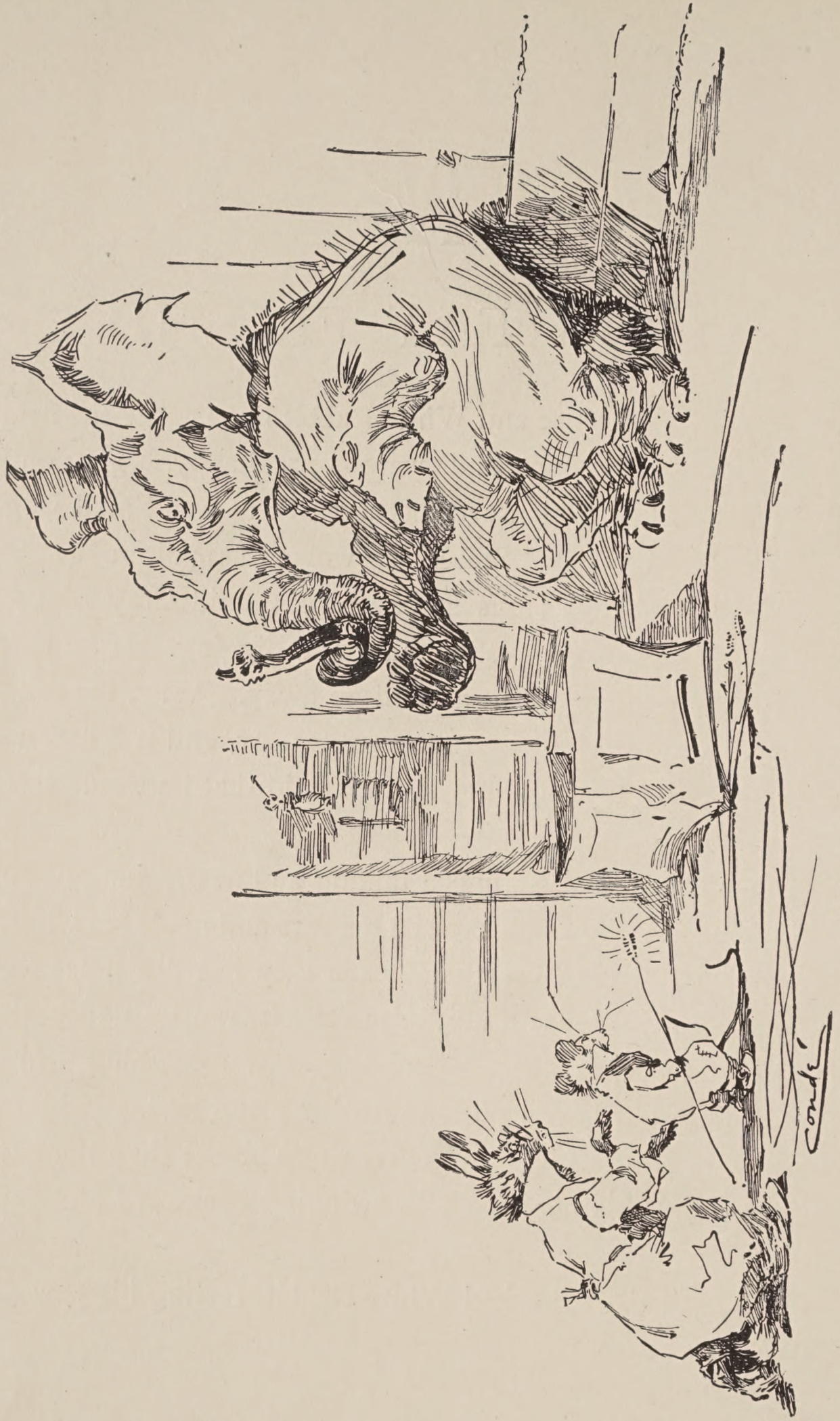
"PLEASE, MIGHTY MOUSE!"